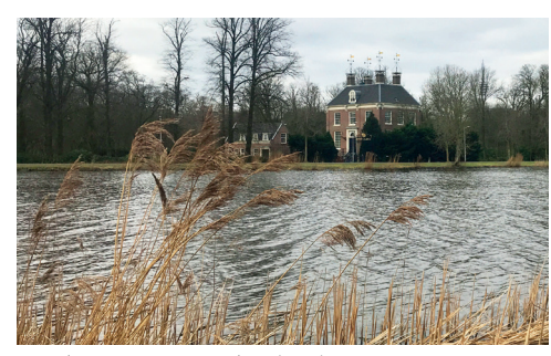
Amstel River, mansion Amstelrust (1724)