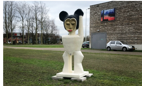
Kuboko Kuminga - strong man/woman, fighter for peace, freedom and justice at CBK Zuidooost (by Monika Dahlberg, 2019)