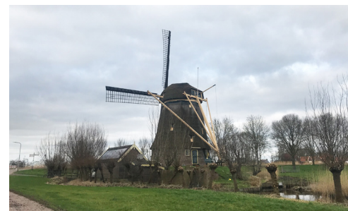
Windmill the Swan (1638)

Anton de Kom is a hero in Surinam. He was an anti-colonial writer, he wrote We Slaves of Surinam (1934) and he was in the resistance during WWII in the Netherlands. He died in a German concentration camp. A statue to honor him is standing on top of the steps at the Anton de Kom Square. He lived in a house on Reestraat 6, that you pass when hiking the 'Walk Center'. Visit the exhibition at CBK Zuidooost, Center of Visual Arts Southeast, Anton de Komplein 120, where small and large, great art is for rent and for sale. It's the only art institution that has inclusiveness in its DNA. Walk west via (A) Station Bijlmer ArenA, follow the Burgemeester Stramanweg, right Weidepad and left Molenpad to Amstel River.