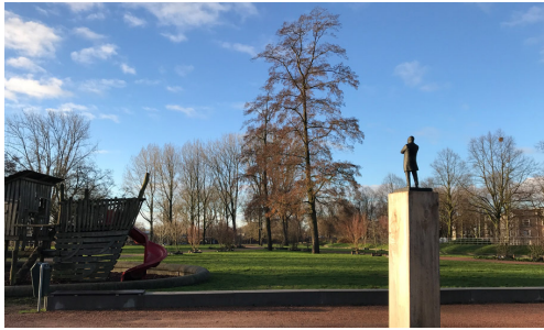
Martin Luther King Park, Amsterdam