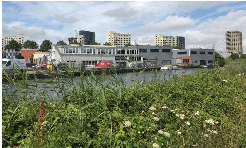
In the background the infamous 'Bijlmerbajes' jail, being deconstructed (summer 2019).

The park was named after Martin Luther King, Jr. to honor him after his assassination on April 4, 1968. Walk north-east along Amstel river, cross the Berlage Bridge, past Amstel Station and follow the Weespertrekvaart.