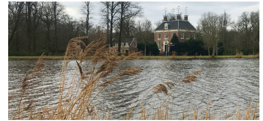
Amstel River, mansion Amstelrust (1724)