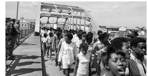
Dr. Martin Luther King, Jr. led marchers across the Edmund Pettus Bridge in Selma on March 21, 1965.

During the beautiful 3 mile walk along the Amstel River (Binnenweg and Oudekerkerdijk), you can listen to a podcast or a speech by Martin Luther King, find them on the Videos & Podcasts page. You will pass the Swan windmill, built in 1638. In the year of 1700 there were 44 mansions along the Amstel River. Nowadays there are only 3 of them left: Oostermeer, Wester-Amstel and Amstelrust. Go underneath the Utrechtsebrug and take the stairs on the right to get onto the Utrecht Bridge.