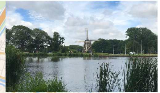
* Rieker Mill at Amstel River