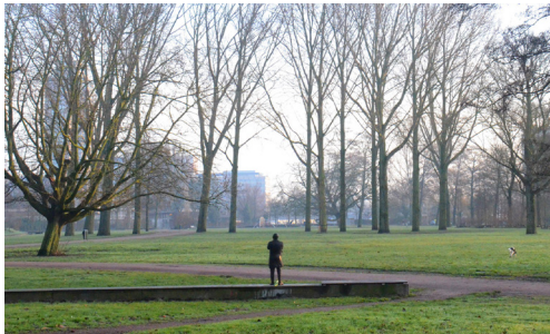
Martin Luther King Park, the bronze Martin Luther King statue, placed on January 15, 2020, his 91st birthday.