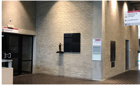
Remembrance sign of the honorary doctorate, and MLK statue, next to the Auditorium, 3rd floor