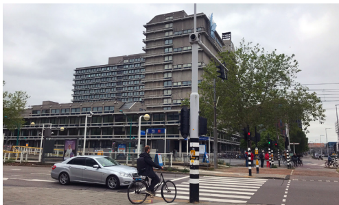
VU Amsterdam, De Boelelaan 1105, Amsterdam

The park was named after Martin Luther King, Jr. to honor him after his assassination on April 4, 1968. Walk south along Amstel River, underneath highway A10, then enter the Amstel Park on the right. Walk through the park, along the Rosarium, cross the Europaboulevard and walk west along the water. Go right to the Van Leijenberglaan and take a left to De Boelelaan, to the VU.