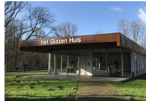
The Glass House in Amstel Park