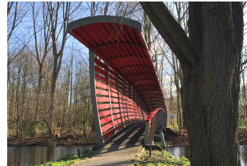
The Red Bridge by Stefan Strauss (2006)

The Amsterdam Forest was designed by Jakoba Mulder and Cornelis van Eesteren and build between 1934 and 1970. In 1900 the famous teacher Jac. P. Thijsse already saw the possibilities for a park on this location. The water level is 18 feet below sea level. In the crisis of the 1930's 20,000 people constructed the park. Besides the rowing track Bosbaan the Forest contains 85 miles of footpaths, 31 mi of bicycle paths, 9 mi bridle paths and 116 bridges. There are 150 tree species, 200 bird species and 700 beetle species. And oak processionary caterpillars. Walk 4 miles through the Forest back to the main entrance, cross Van Nijenrodweg, walk through Gijsbrecht van Aemstel Park, cross Europaboulevard and walk over the Red Bridge into the Amstel Park.