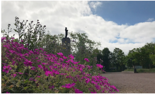
Martin Luther King Park, 1 of the 50 MLK statues, placed on April 4, 2018, to remember the 50th anniversary of Dr. King's assassination.