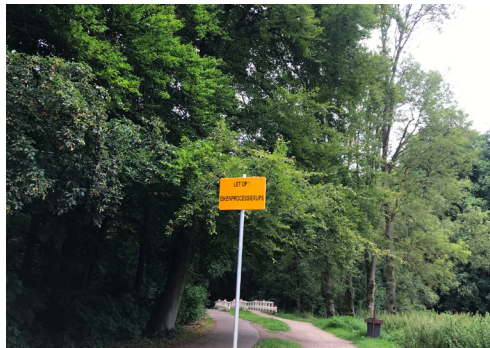
In the summer season watch out for oak processionary caterpillars

VU Amsterdam was founded in 1880 and is a Christian research university with an academic hospital and more than 26,000 students. The logo is a blue image of a griffin: the body, legs and tail of a lion, head and wings of an eagle and the ears of a horse (nickname: VU-chicken). Go through the main entrance and take the stairs to the 3rd floor. Next to the Auditorium there is a sign to remember the honorary doctorate in Social Sciences that Dr. King was awarded with by the VU on October 20, 1965 (see videos). Next to it stands the Martin Luther King statue. Continue along De Boelelaan, go left to the Van der Boechhorststraat, and right to the Amsterdam Forest.