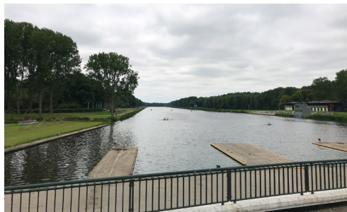
The 2.2 km long rowing track the Bosbaan was opened 1934