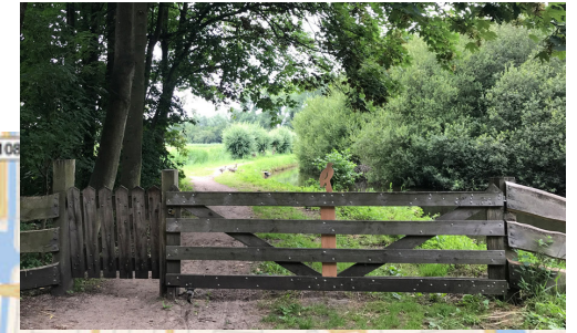
*Amsterdamse Bos, Zuidelijke Oeverlanden